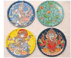
These hand-painted patachitra wooden plates from Bare Hand Creations by Tanmay Mohapatra from Odisha, are perfect to add to your home décor collection as these plates can be used as wall hangings. Rs 1,800 each