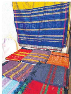
This stall by Jahabhai L. Rathod from Gujarat had silk saris with a unique embroidery called Tangaliya stitch, which is a 700-year-old method of hand-stitching. The stall also had Tangaliya stitch shawls, stoles and kurta pieces. Rs 3,000 to Rs 12,000