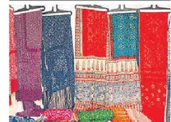
Shohel Khatri displayed some beautiful and colourful bandhani saris and dupattas in silk and chanderi materials. Saris started from Rs 15,000 and dupattas from Rs 500