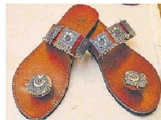
These handmade leather kohlapuris with oxidized embellishments—a must-have in your footwear collection—were from Amit Kumar Handmade Jutis and Slippers. Rs 1,250