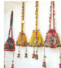
These soof embroidered potli bags from Parkar Hand Embroidery by Dayaben Dohat from Gujarat will add the oomph factor to your simple look. They also had soof embroidered purses, bags and batus . Rs 2,800 to Rs 6,500