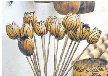
Dewangan Jagat Ram displayed different forms of bamboo home décor items like flutes, wall hangings, tulip flower sticks, small bamboo mugs, ashtrays and more. Rs 300 per piece