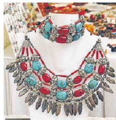
This stall by Sheela Negi had some beautiful Himalayan Artifacts like antique jewellery pieces, mirrors, earrings and more. Rs 4,500