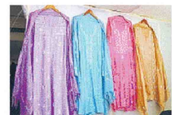
Mohammad Kalam Khan and Mohsin Khan from Lucknow displayed a wide variety of chikankari kurta sets in white and pastel shades on silk and cotton materials, perfect for summer wear. Rs 1,500 onwards

Visitors explored the stalls and browsed through the aesthetic products which were on display.