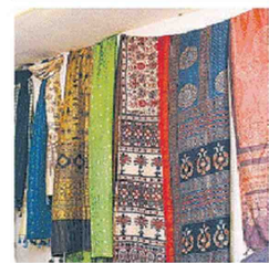
Kara Ajrakh had some beautiful ajrakh -printed saris, dupattas and suit pieces in different materials like moral silk and cotton. Rs 3,000 to Rs 1,2000