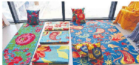
The Crewel by Jahangir Bhatt from Kashmir had a vibrant series of cushion covers, floor rugs, bed linens, curtains and more, which would add a touch of colour to your home. Rs 600 to Rs 12,000